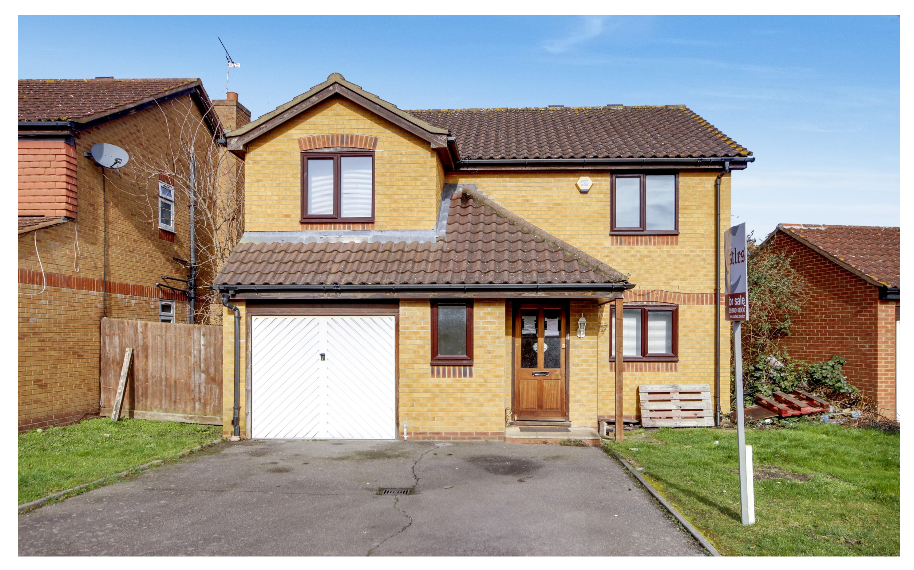
Carnegie Close, EN3 6XX