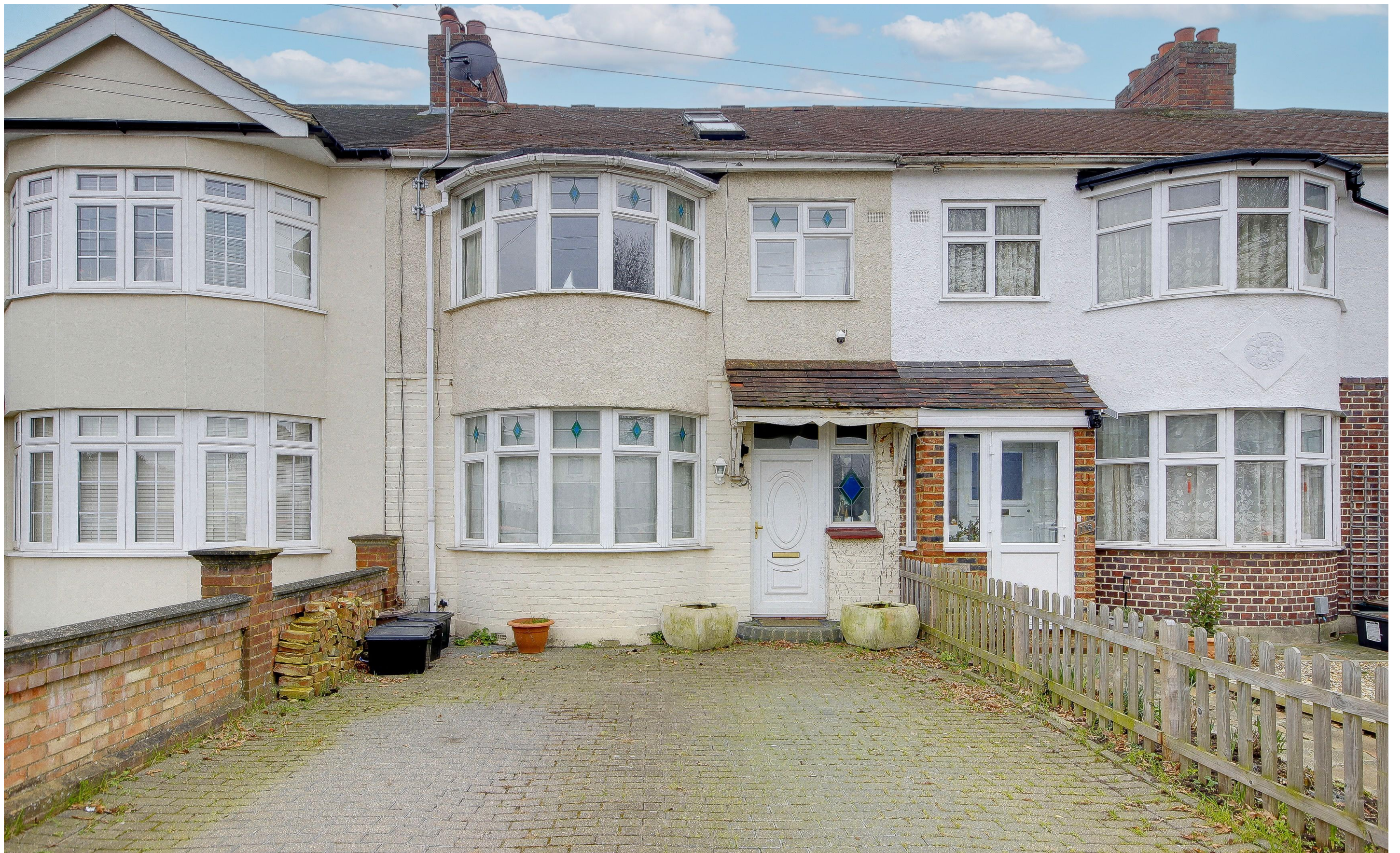
Lodge Crescent, Waltham Cross, EN8 8BJ £525,000