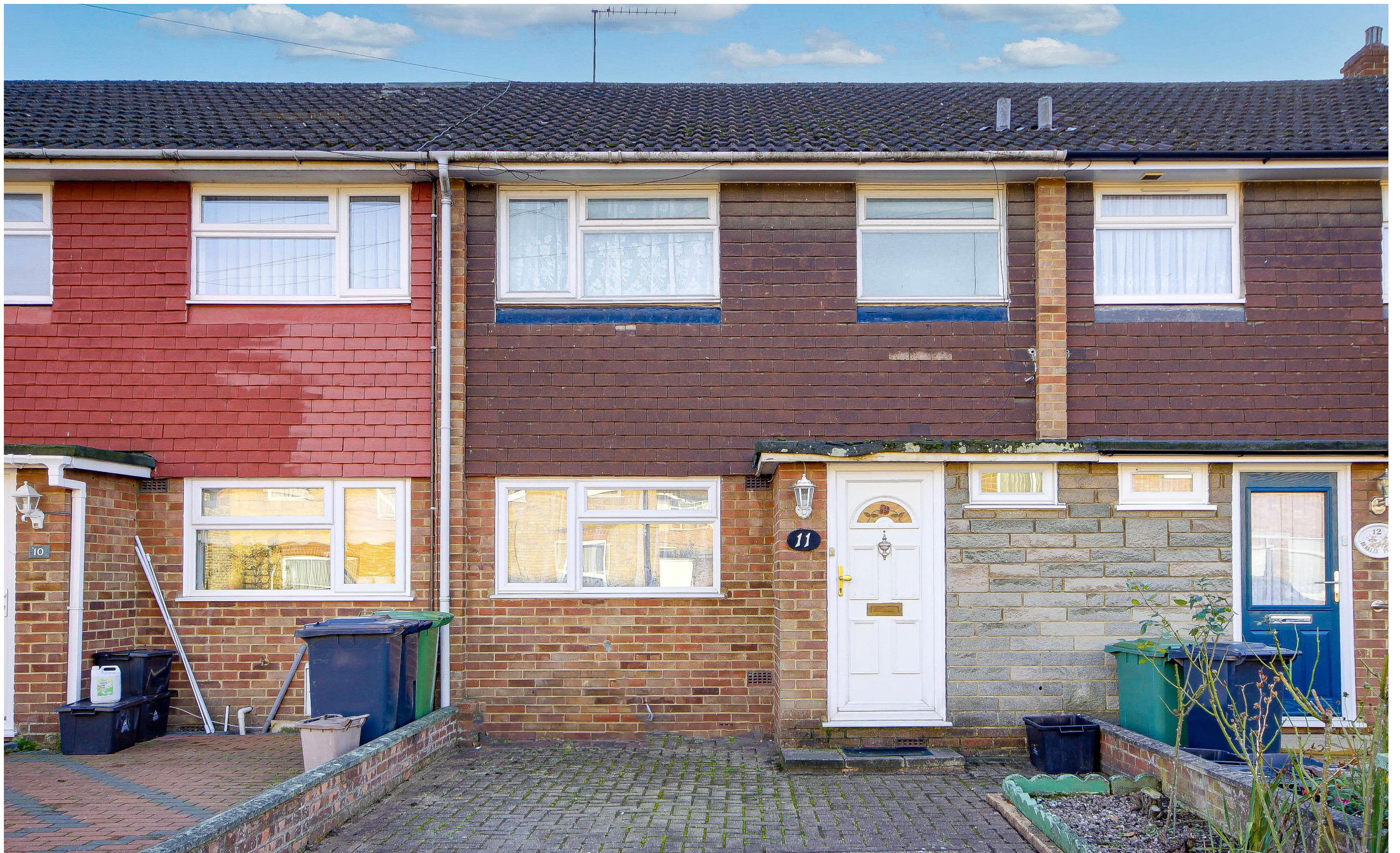
Berkley Place, Park Lane, Waltham Cross, EN8 8AA £385,000