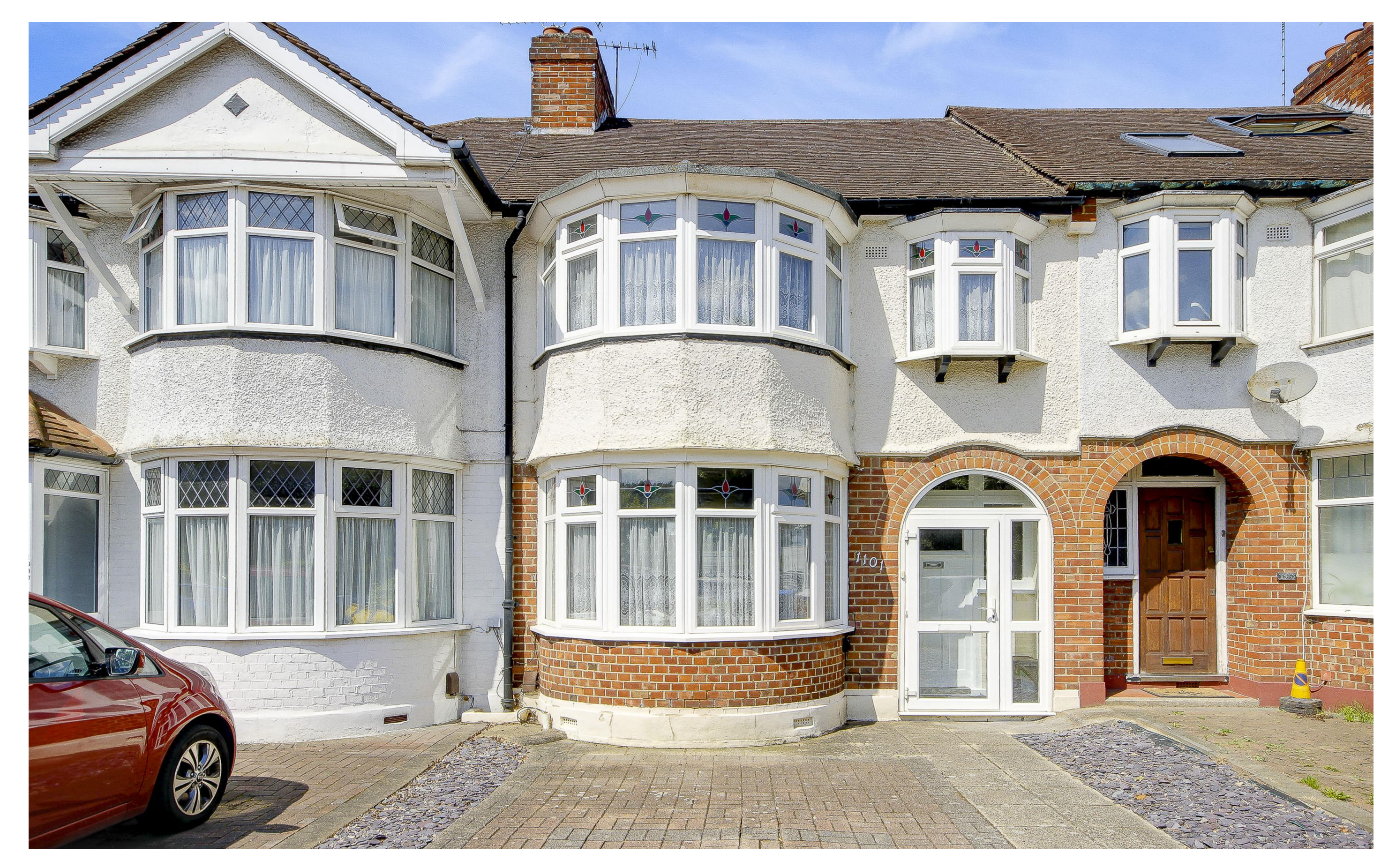
Great Cambridge Road, EN1 4DB