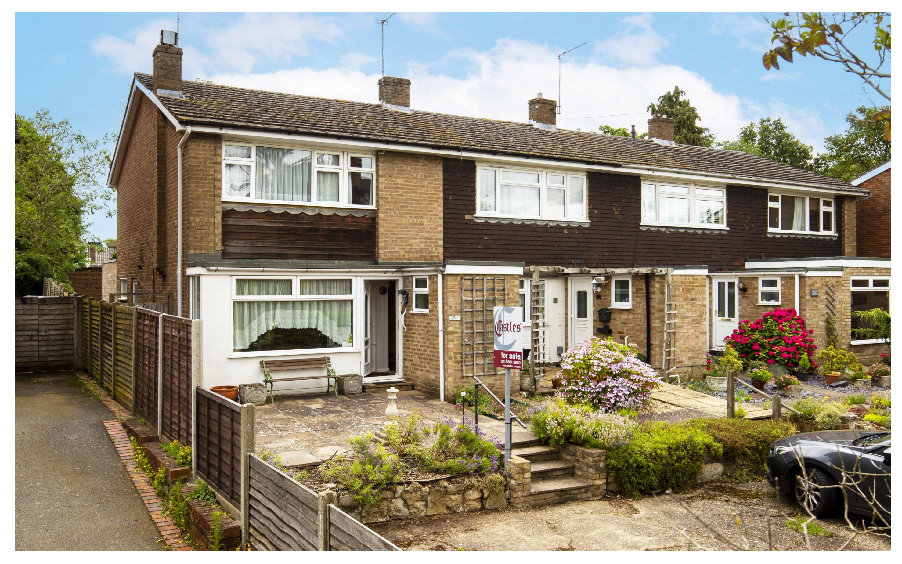
St.Catherines Road, Broxbourne, EN10