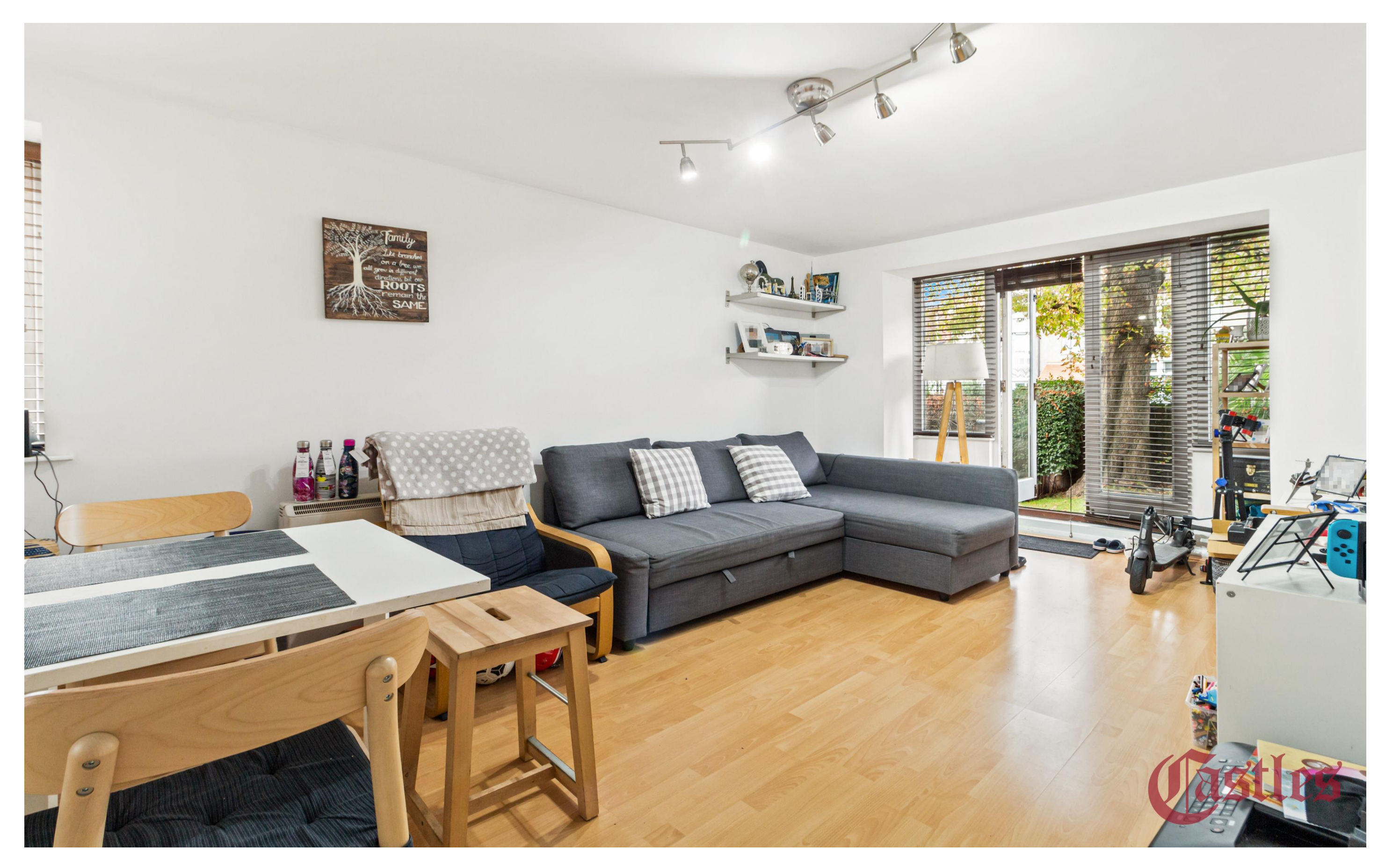
Hillfield Avenue, N8