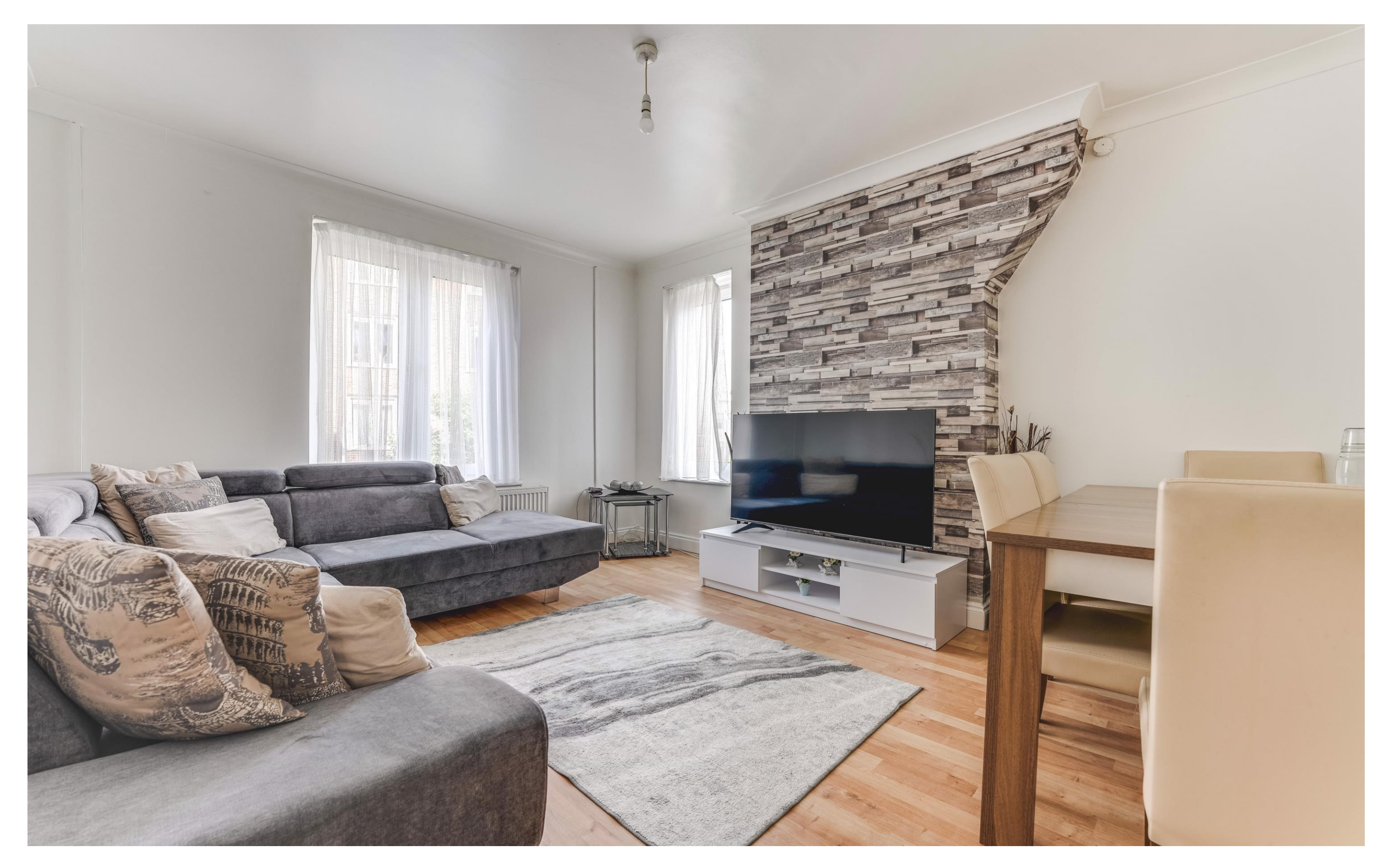
Elvin House, Morning Lane, E9 6LA