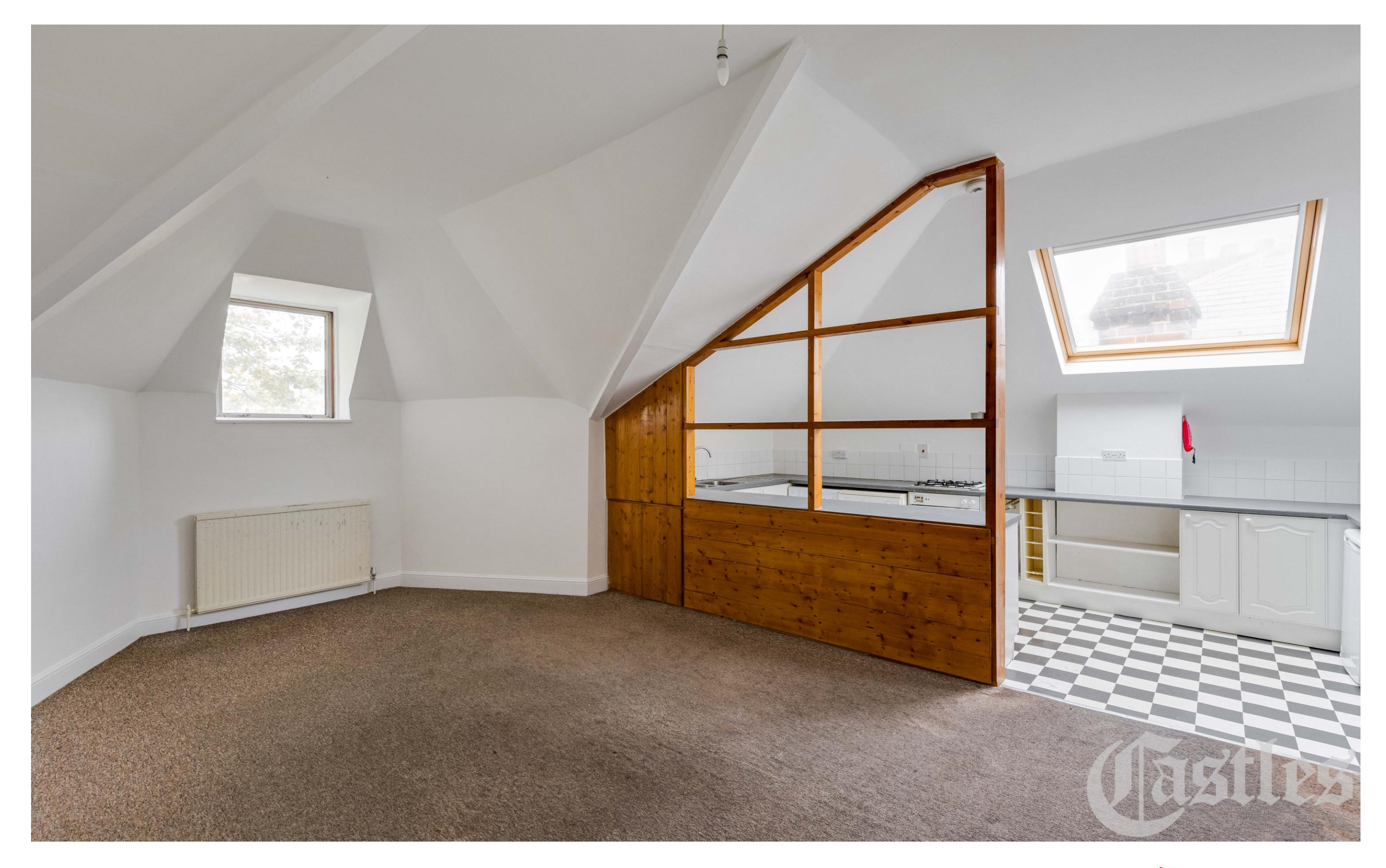
Mount Pleasant Lane, E5 9EW