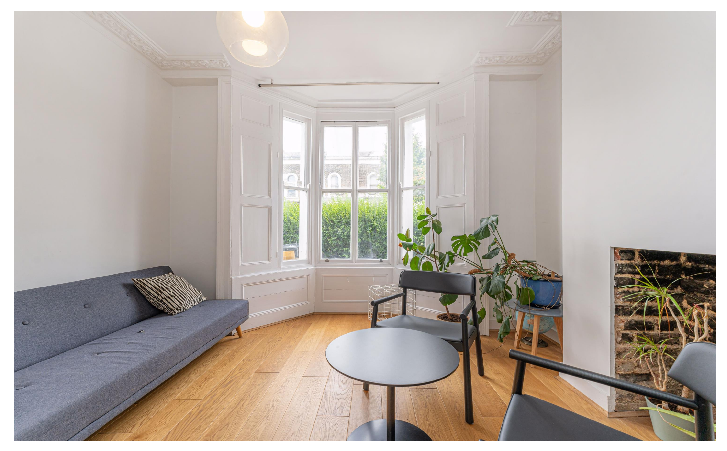
Dunlace Road, E5 0ND