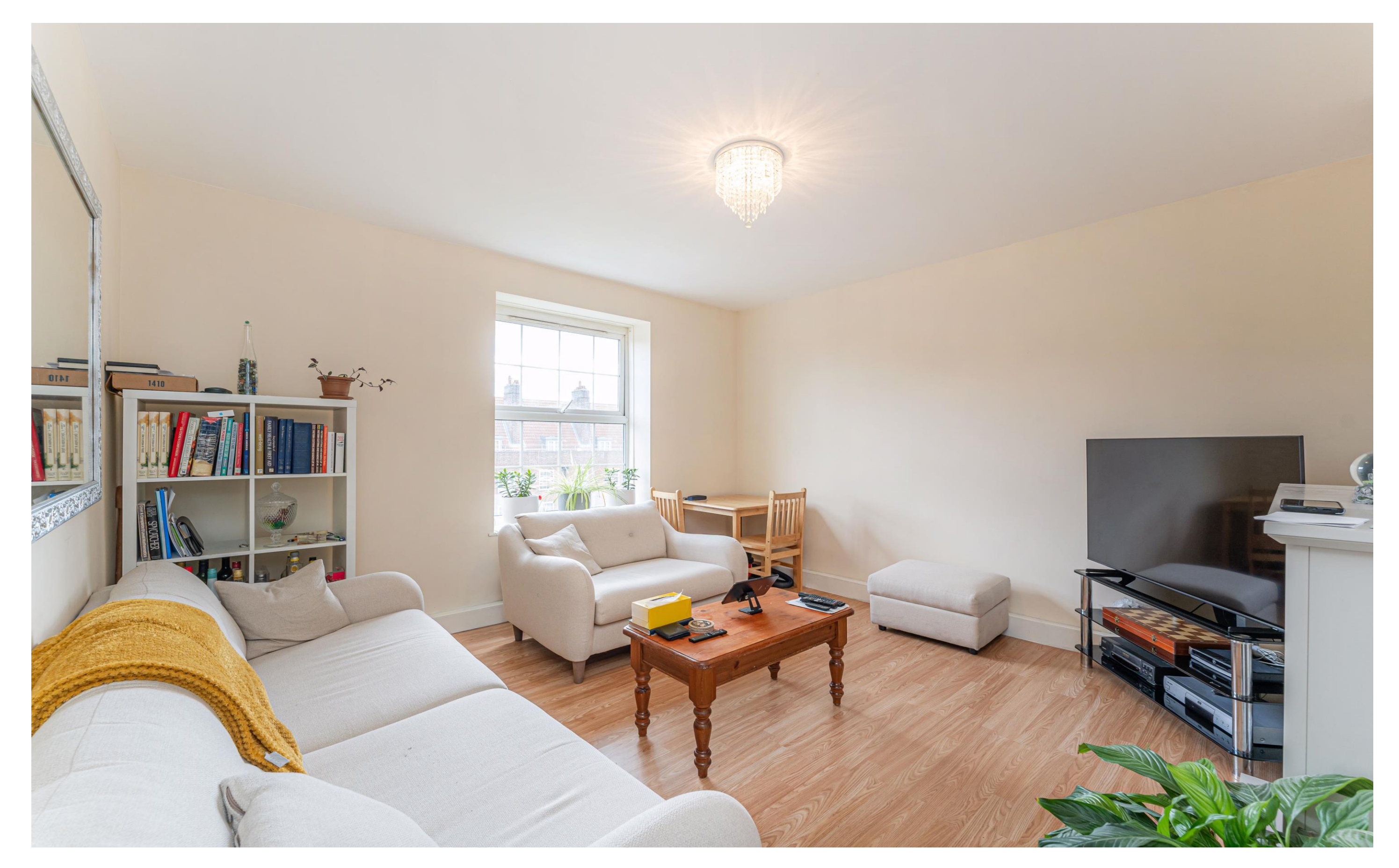
Stamford Hill, N16 6QS