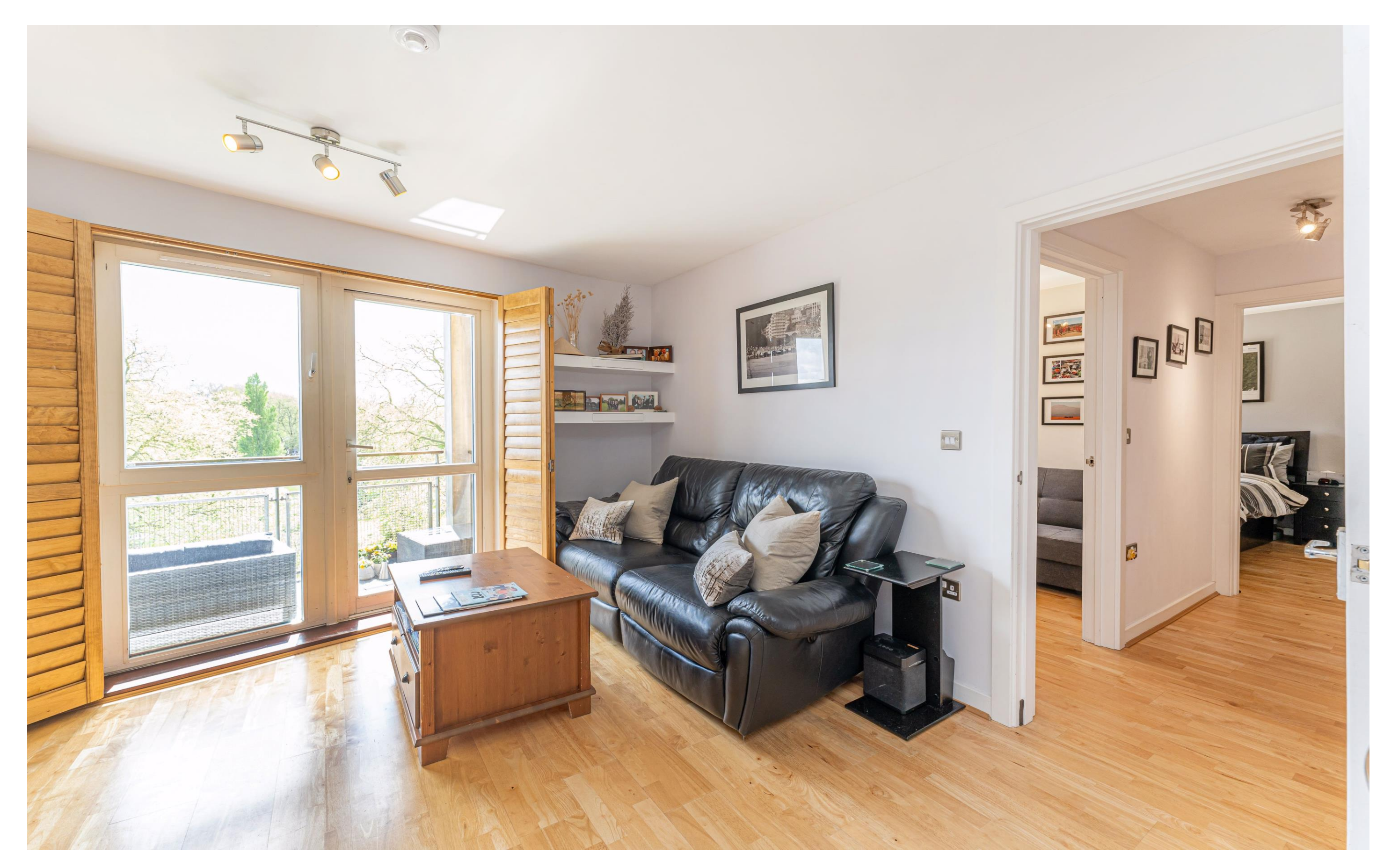
Limehouse Lodge, Harry Zeital Way, E5 9RN