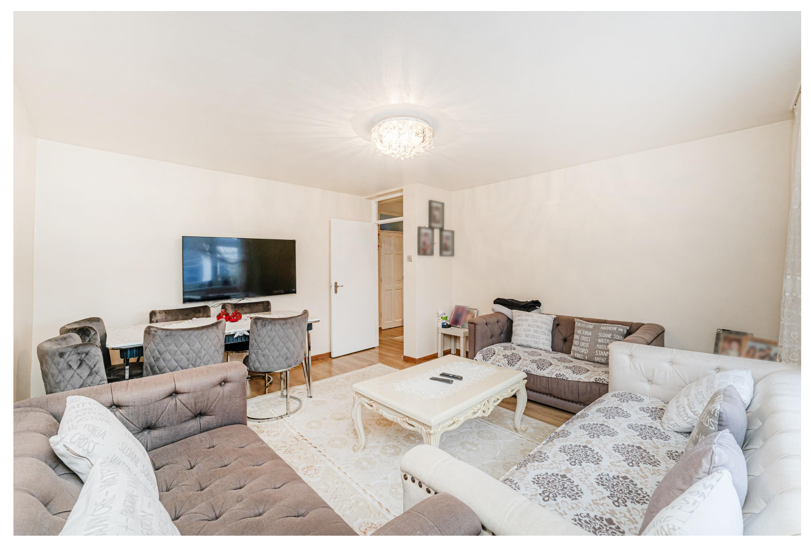
Banister House, Homerton High Street, E9 6BT