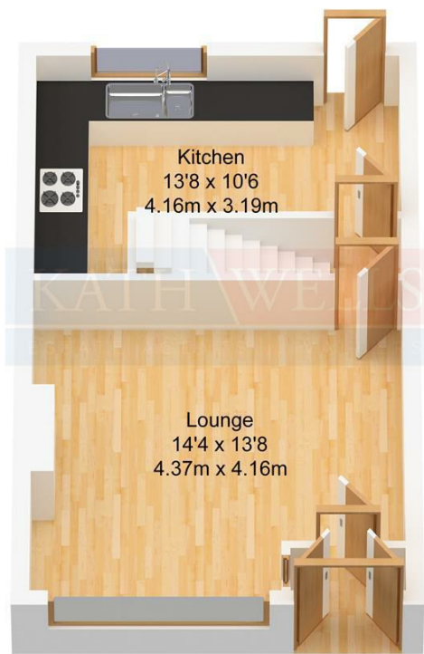
Ground Floor Approx. 31.90 sqm. (343.30 sqft.)