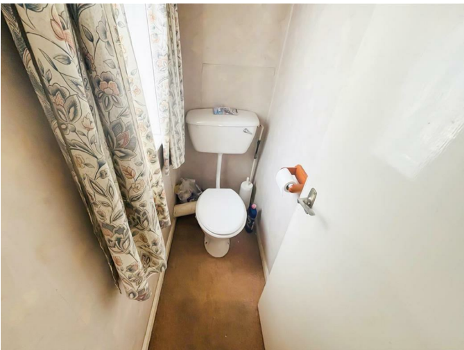
Double glazed window, a white low flush WC