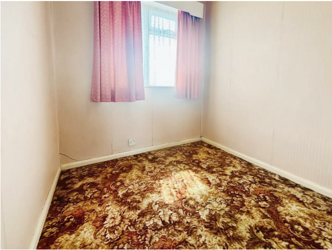
Double glazed window, central heating radiator, a good sized single / third bedroom