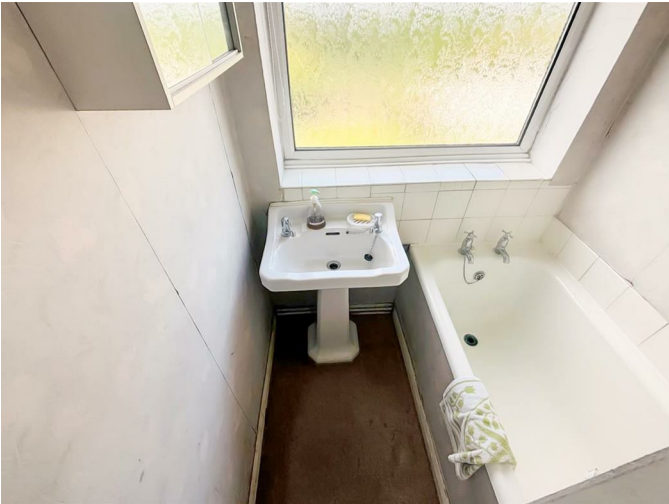
Double glazed window, a white suite comprising of a panelled bath & wash basin