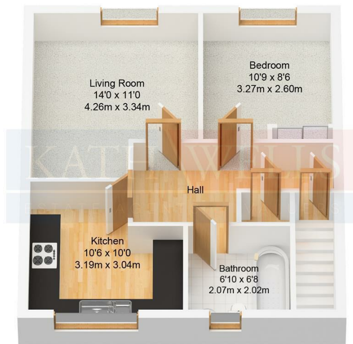
First Floor Approx. 45.57 sqm. (490.51 sqft.)