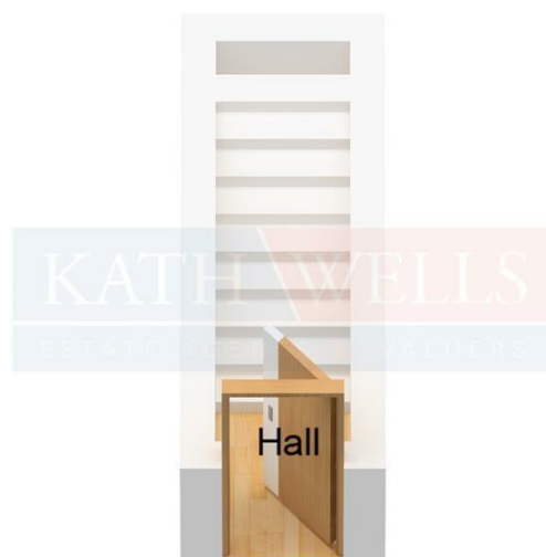
Ground Floor Approx. 2.31 sqm. (24.86 sqft.)