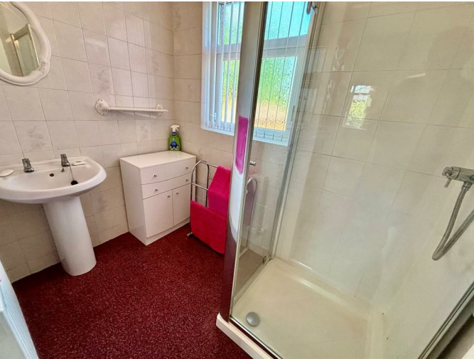
Double glazed window, a glazed shower cubicle with a shower, wash basin, central heating radiator