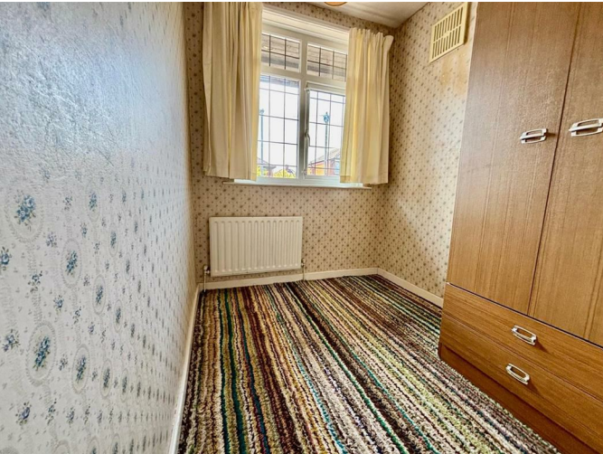
Double glazed window, central heating radiator