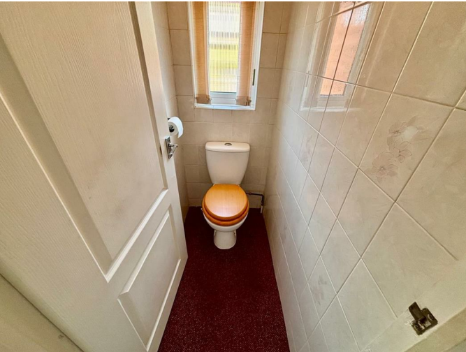
Double glazed window, low flush WC