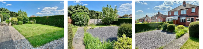
The front garden is partly enclosed and mainly low maintenance with some planting. The rear garden is a good size, has a sunny aspect and a lawn, planted beds containing a variety of shrubs, and a low maintenance area

Council Tax Band & EPC Rating: Council Tax Band: C / EPC Rating: tba