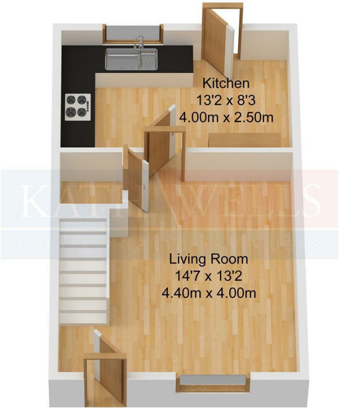
Ground Floor Approx. 304.00 sqm. (28.00 sqft.)