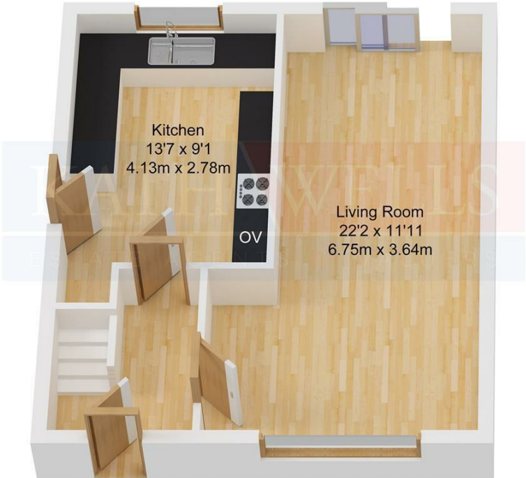
Ground Floor Approx. 38.50 sqm. (414.30 sqft.)