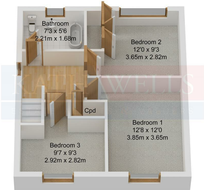
First Floor Approx. 38.50 sqm. (414.30 sqft.)