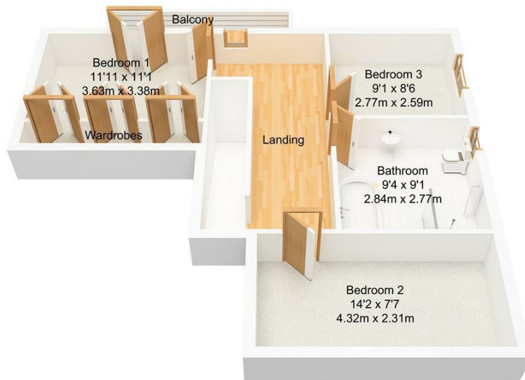
First Floor Approx. 56.10 sqm. (603.40 sqft.)