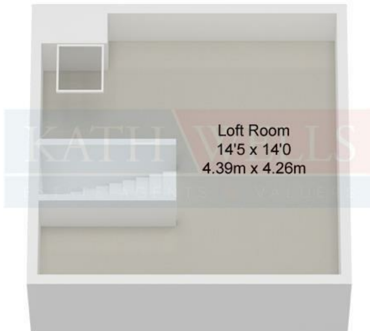
Second Floor Approx. 18.70 sqm. (201.28 sqft.)