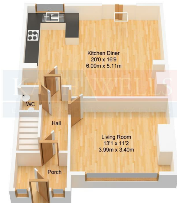
Ground Floor Approx. 53.80 sqm. (579.09 sqft.)