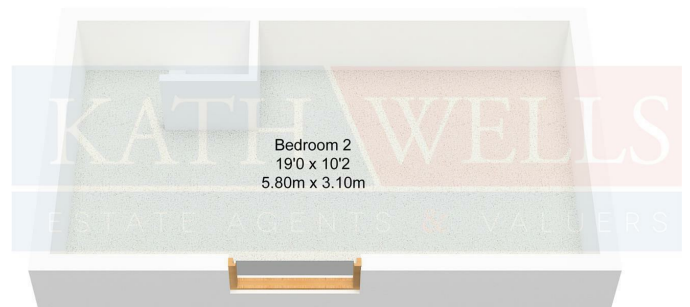
Second Floor Approx. 18.24 sqm. (196.33 sqft.)