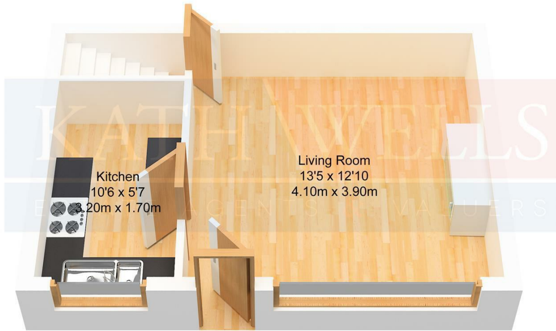
Ground Floor Approx. 23.37 sqm. (251.55 sqft.)