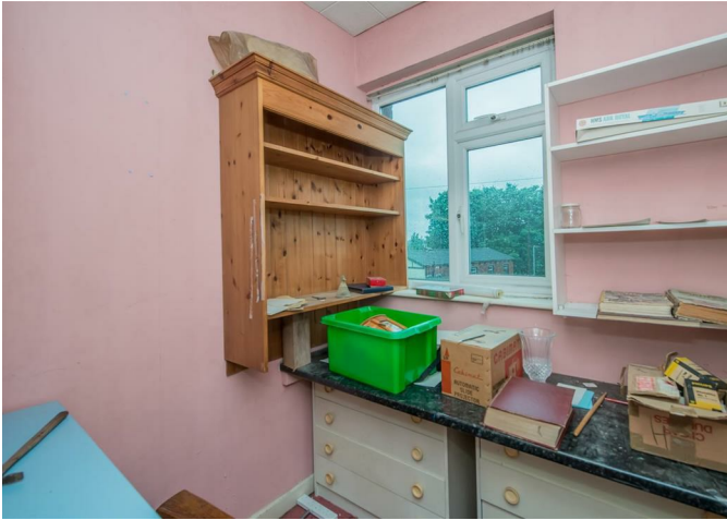
Double glazed window