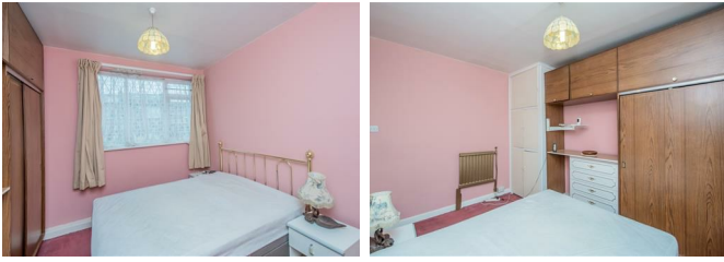
Double glazed window, central heating radiator