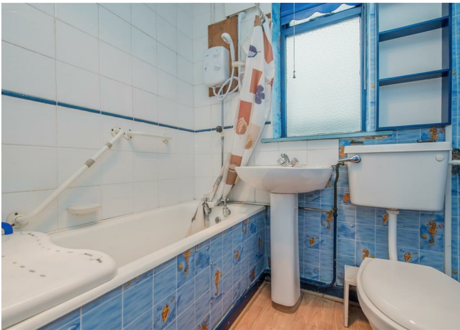
Double glazed window, a three piece bathroom suite