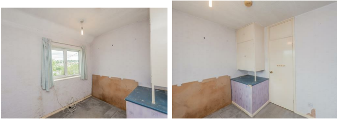
Double glazed window, storage cupboard