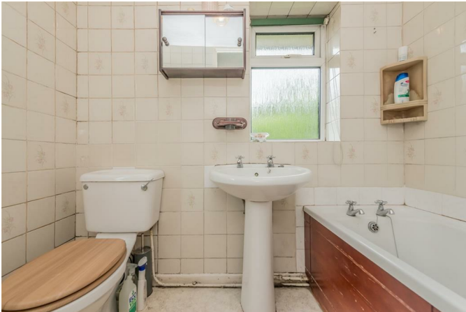
Two double glazed windows, a white suite comprising of a panelled bath with an electric shower above, wash basin, low flush WC