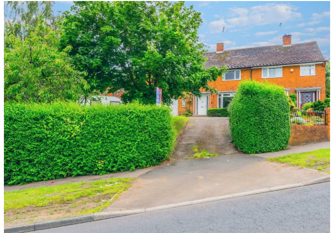
A driveway provides useful off street parking for several cars and access to a single garage.