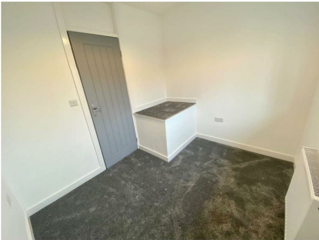
Double glazed window, central heating radiator