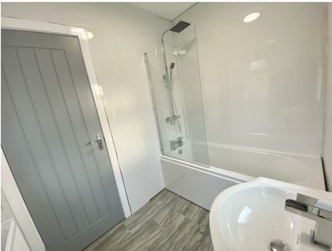
Double glazed window, a modern white suite comprising of a panelled bath with a plumbed shower above (rainfall and hand-wand shower heads) and a glazed side screen, wash basin set into a vanity unit, low flush WC with a concealed cistern, central heating radiator / towel warmer