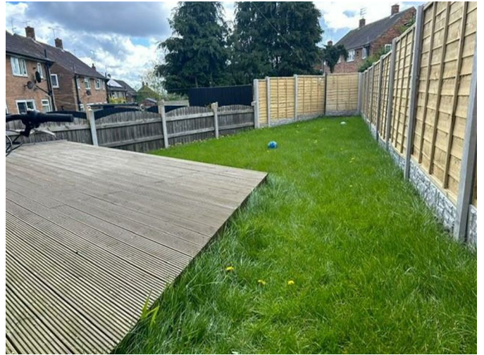
The gardens extend to three sides and are mainly lawn; there is a seating area in the rear garden