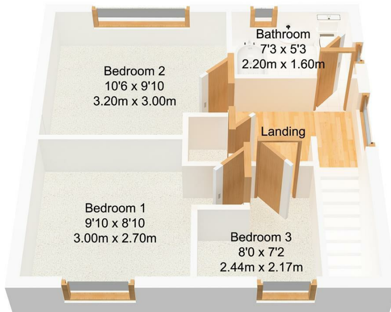
First Floor Approx. 31.90 sqm. (343.00 sqft.)