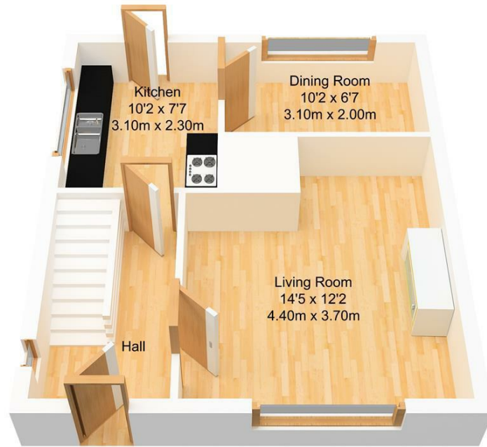
Ground Floor Approx. 35.75 sqm. (384.80 sqft.)