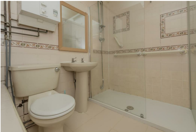
A good sized shower room benefitting from a walk-in shower cubicle with a plumbed shower, wash basin, low flush WC, central heating radiator