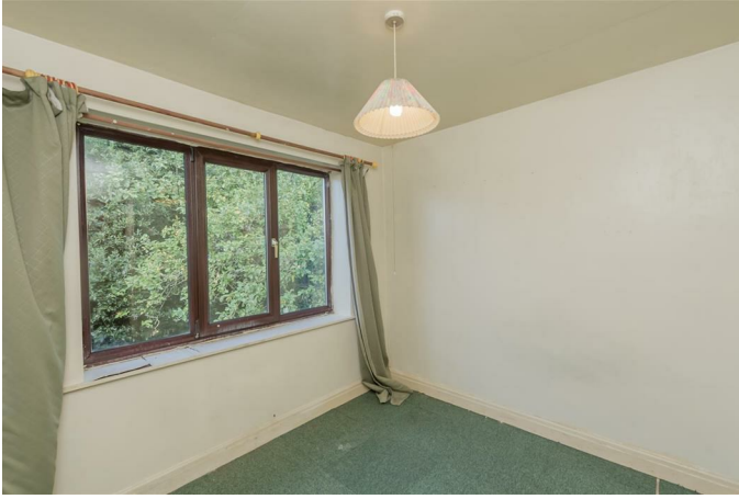
Double glazed window, central heating radiator