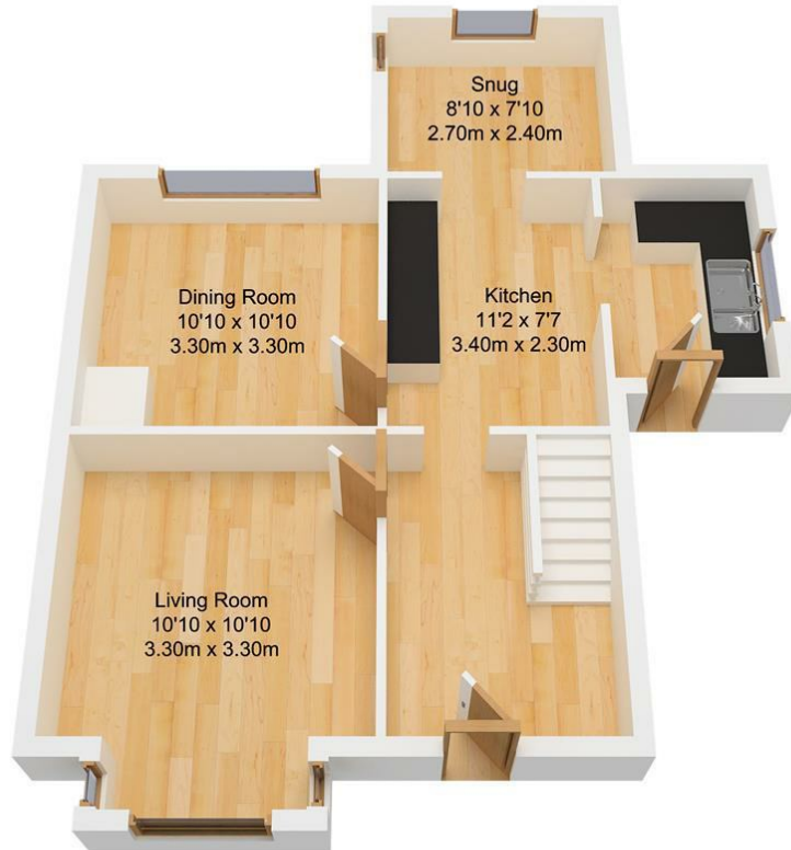
Ground Floor Approx. 52.08 sqm. (560.58 sqft.)