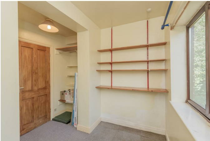
Double glazed window, central heating radiator