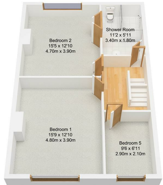
First Floor Approx. 59.17 sqm. (636.90 sqft.)