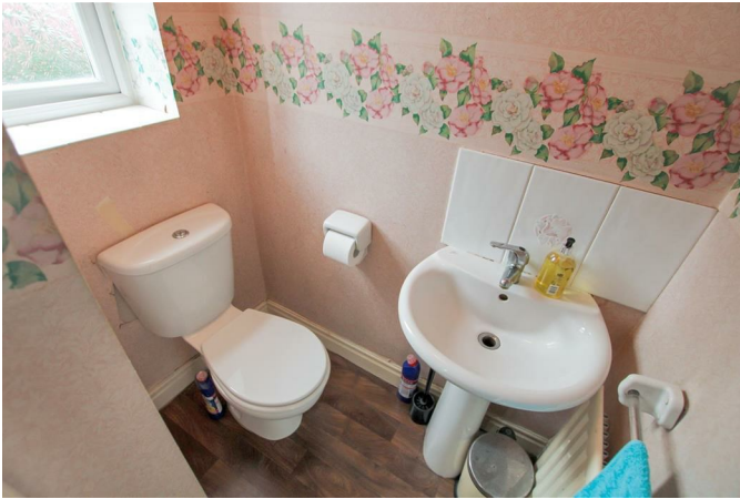
A two piece suite comprising of a wash basin and WC, double glazed window to the front elevation, central heating radiator