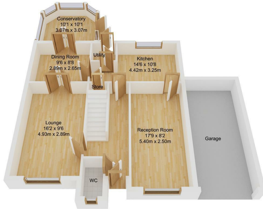
Ground Floor Approx. 84.47 sqm. (909.22 sqft.)