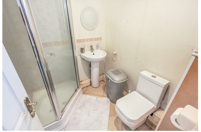
A three piece suite comprising of a shower cubicle with an instant shower, a wash basin and a WC, tiled floor, a chrome ladder style radiator, tiled floor