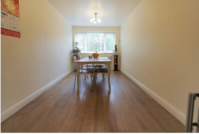
Double glazed window to the front elevation, central heating radiator, solid wood oak floor