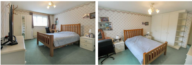
Double glazed window to the front elevation, central heating radiator, fitted wardrobes