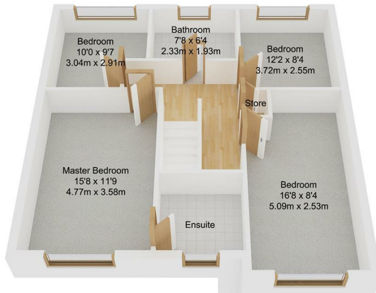
First Floor Approx. 59.08 sqm. (635.93 sqft.)