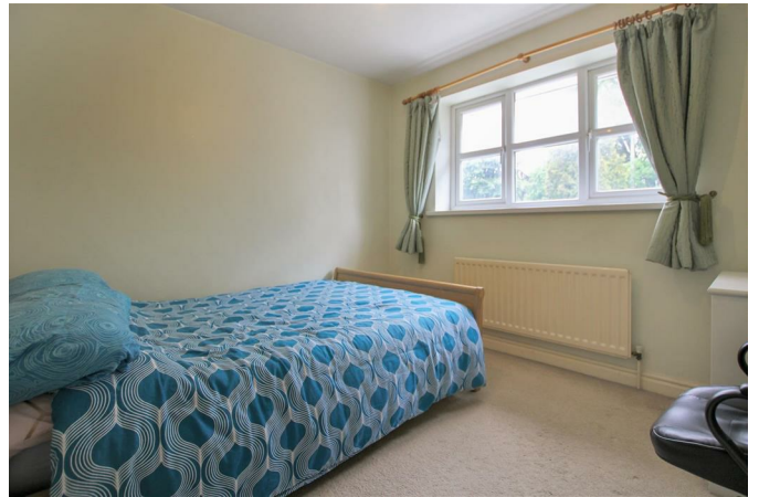
Double glazed window to the rear elevation, central heating radiator