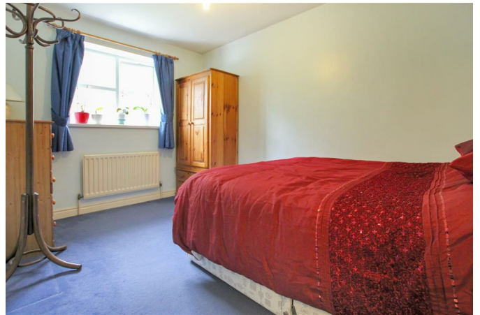
Double glazed window to the rear elevation, central heating radiator