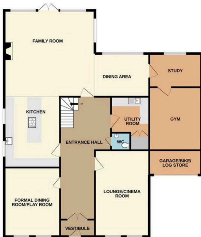
GROUND FLOOR 1911 sq.ft. (177.5 sq.m.) approx.