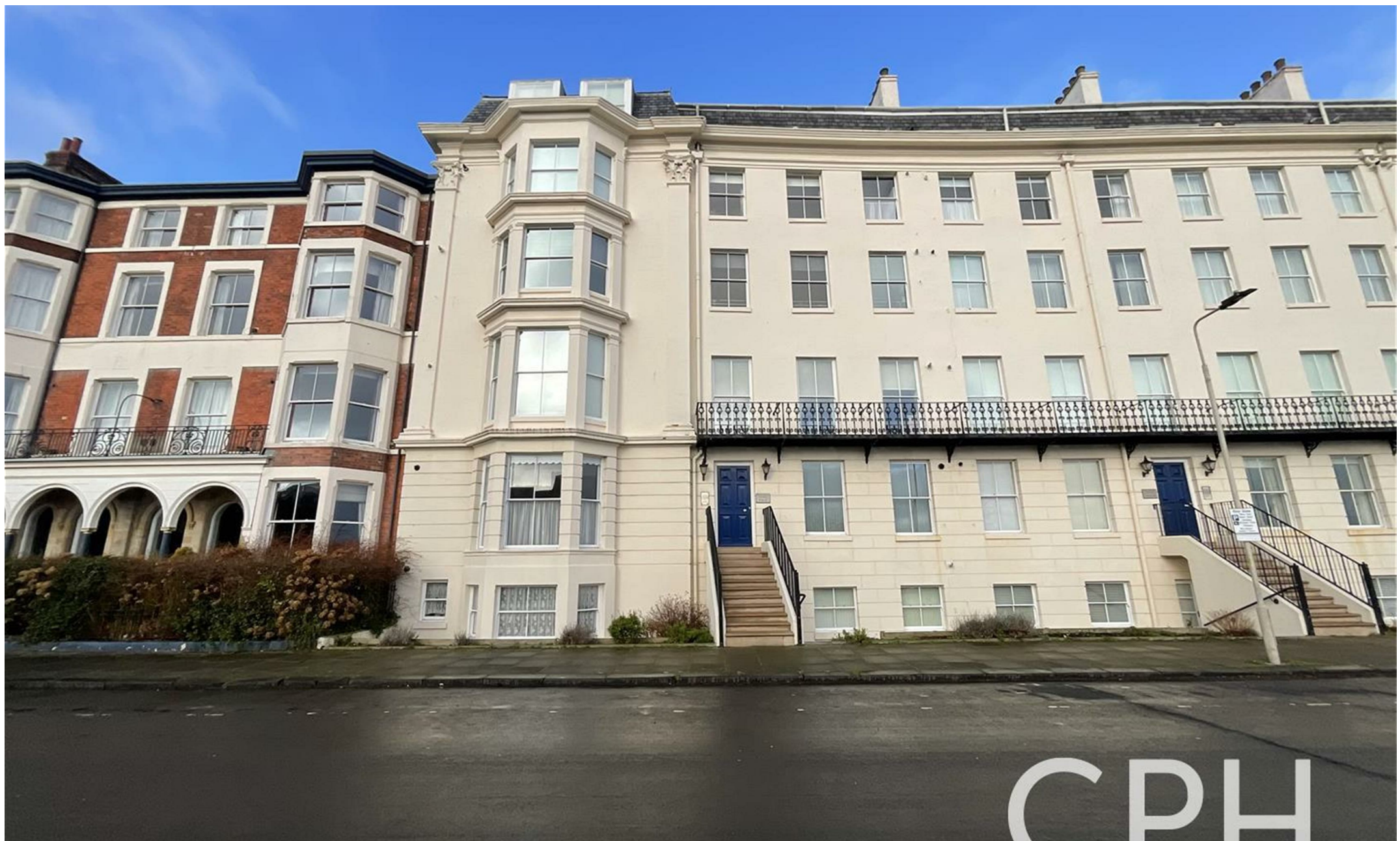
Prince of Wales Apartments Prince Of Wales Terrace, Guide Price £280,000