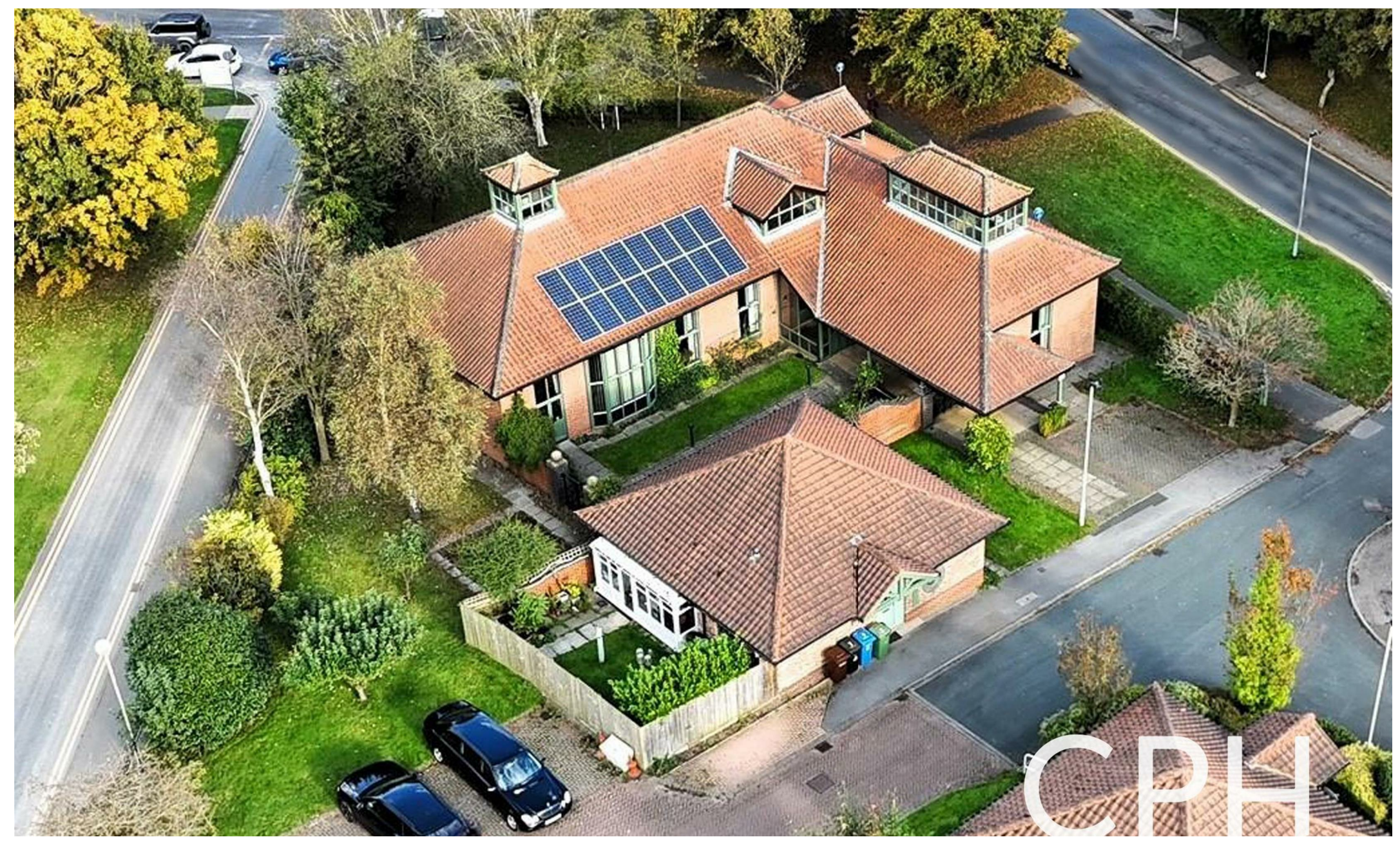
Friends Meeting House & 7 Quaker Close, Scarborough Guide Price £595,000