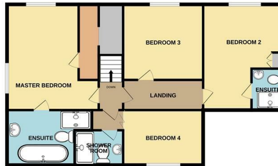
TOTAL FLOOR AREA: 2546 sq.ft. (236.6 sq.m.) approx.

Whilst every attempt has been made to ensure the accuracy of the floorplan contained here, measurements of doors, windows, rooms and any other items are approximate and no responsibility is taken for any error, omission or mis-statement. This plan is for illustrative purposes only and should be used as such by any prospective purchaser. The services, systems and appliances shown have not been tested and no guarantee as to their operability or efficiency can be given. Made with Metropix ©2024