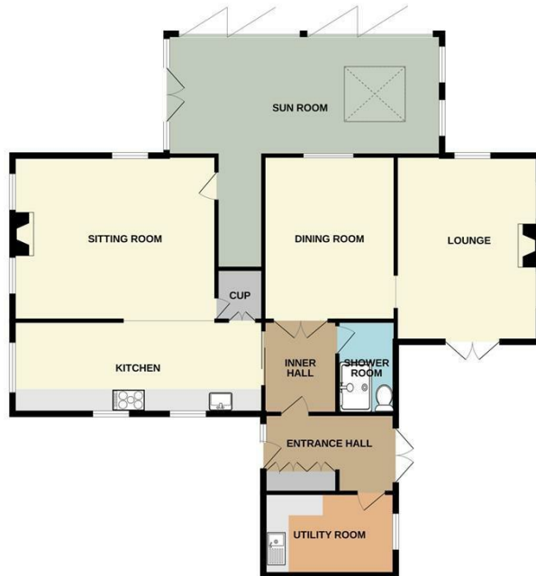
GROUND FLOOR 1504 sq.ft. (139.7 sq.m.) approx.