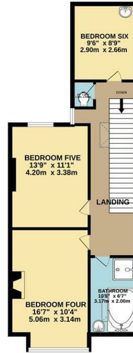
2ND FLOOR 622 sq.ft. (57.8 sq.m.) approx.