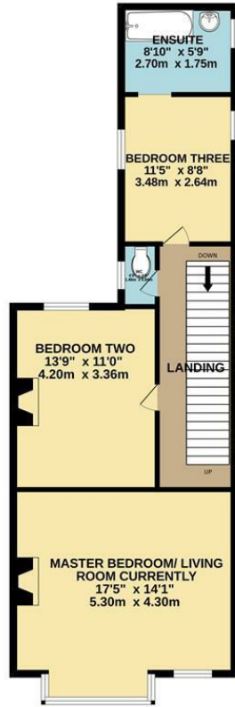
1ST FLOOR 678 sq.ft. (63.0 sq.m.) approx.