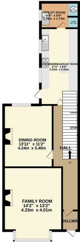
GROUND FLOOR 679 sq.ft. (63.0 sq.m.) approx.