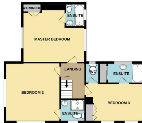
1ST FLOOR 737 sq.ft. (68.5 sq.m.) approx.