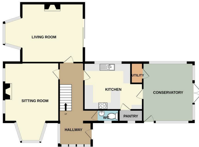
GROUND FLOOR 1030 sq.ft. (95.7 sq.m.) approx.