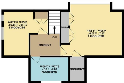
1ST FLOOR 481 sq. ft. (44.7 sq.m.), approx.