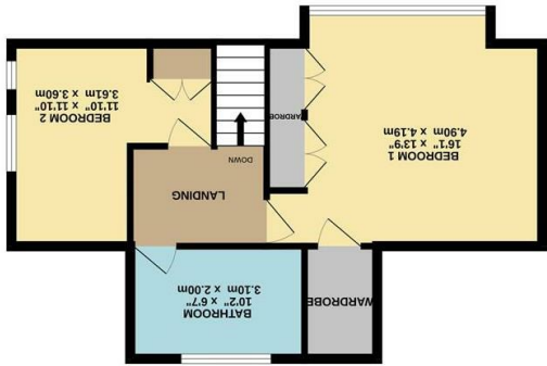
1ST FLOOR 481 sq. ft. (44.7 sq.m.) approx.