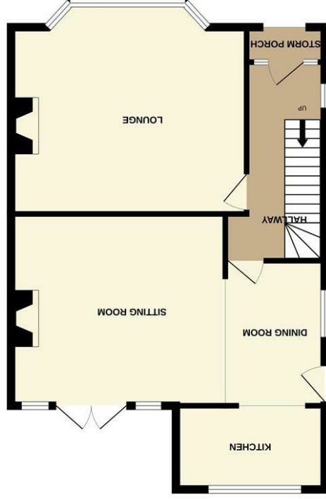
GROUND FLOOR (60.4 sq.m.) approx.

While every attempt has been made to ensure the accuracy of the floorplan contained these measurements do not constitute a guarantee of area. The floorplan is for illustrative purposes only and should be used as such by any prospective purchaser. The services, systems and appliances shown have not been tested and no guarantee as to their operability or efficiency can be given. Made with Metropix ©2024