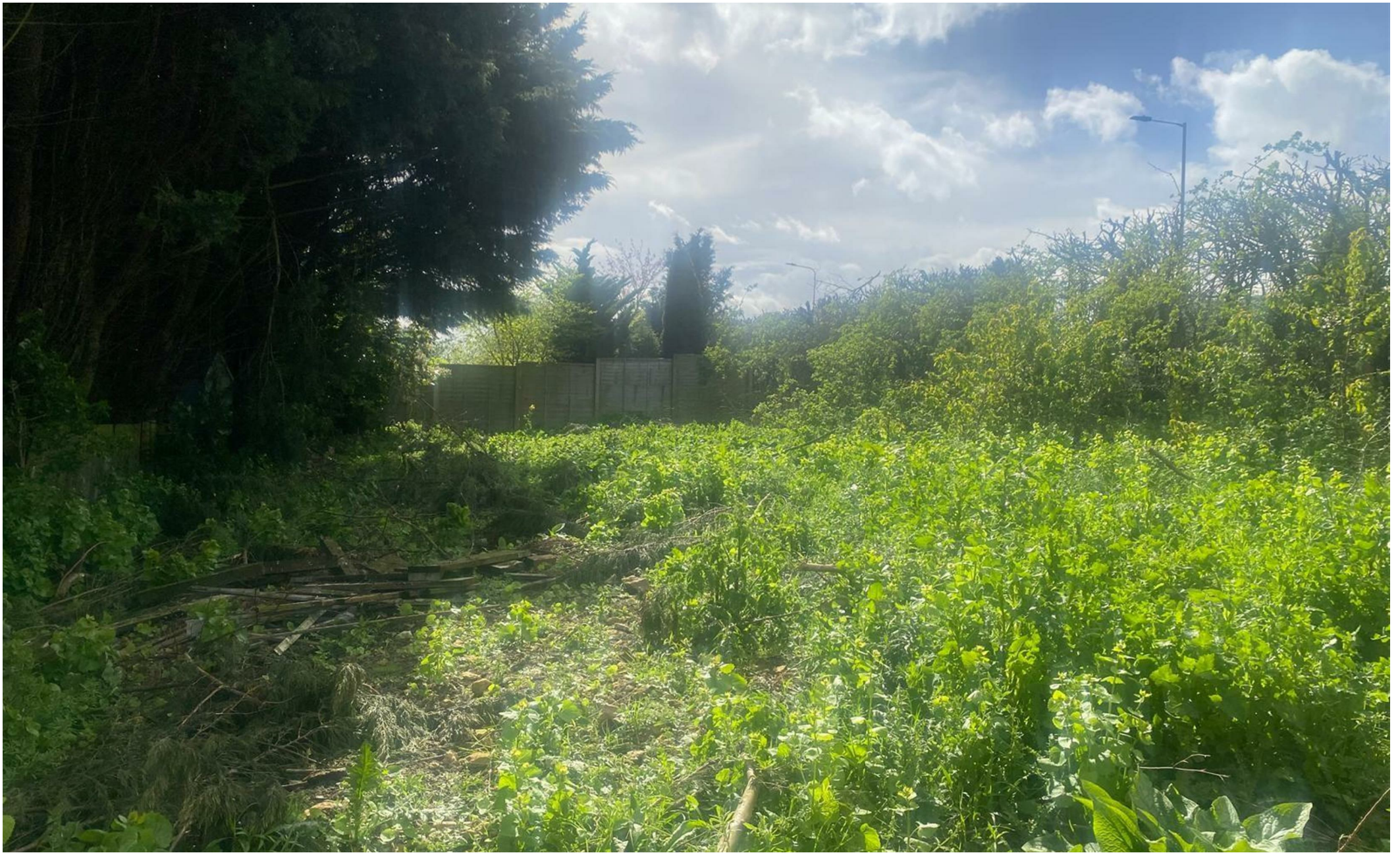
Plot of Land, Scarborough Road, Crossgates, Scarborough, YO12 4JL Price Guide £40,000