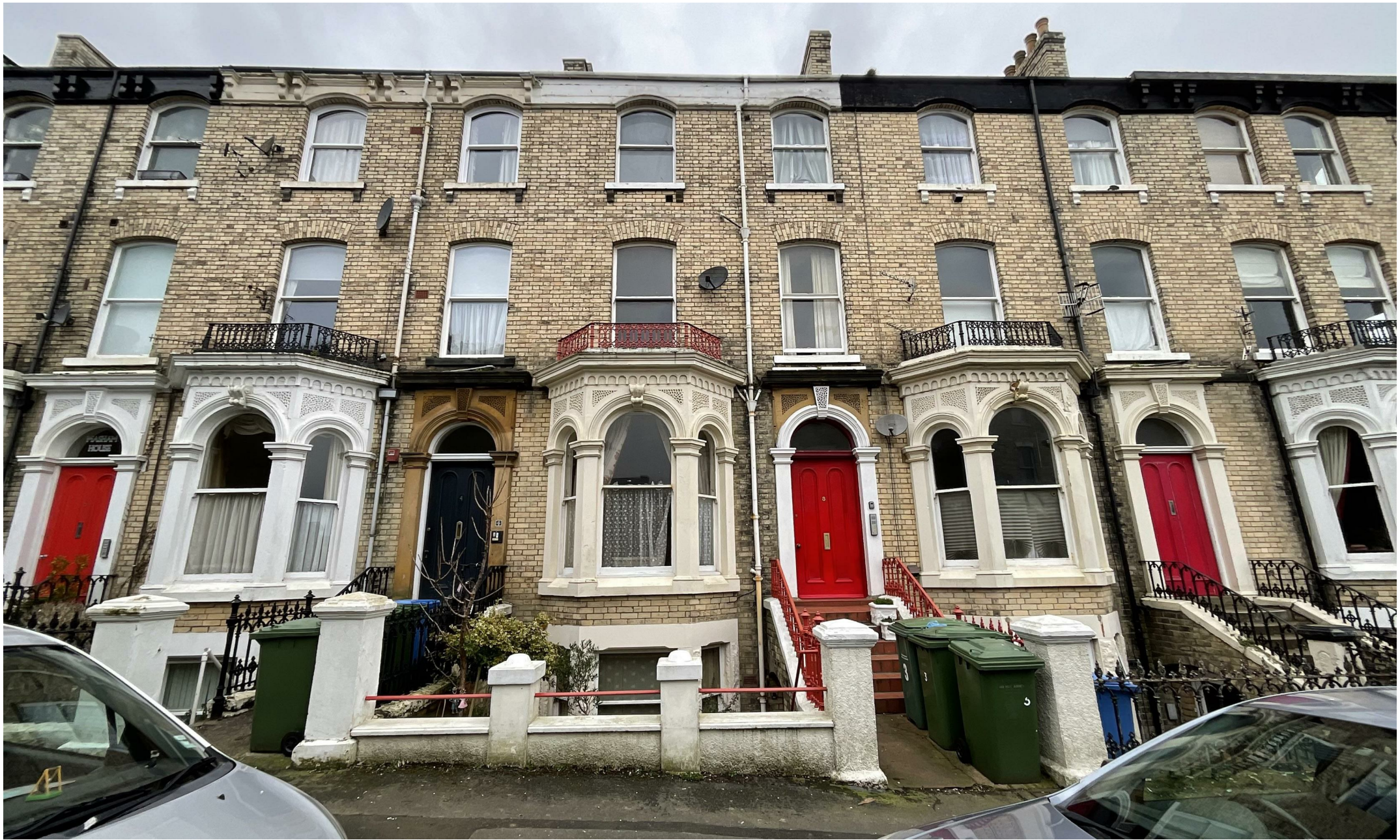
3 Grosvenor Crescent, Scarborough YO11 2LJ Auction Guide £150,000