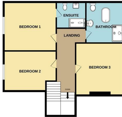
1ST FLOOR 959 sq.ft. (89.1 sq.m.) approx.