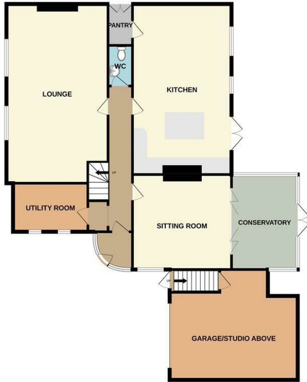
GROUND FLOOR 1650 sq.ft. (153.2 sq.m.) approx.