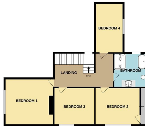
1ST FLOOR 908 sq.ft. (84.4 sq.m.) approx.