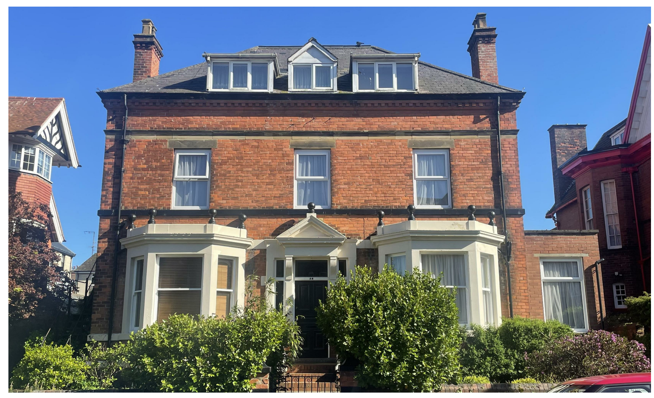
38 Avenue Victoria, Scarborough YO11 2QT £530,000