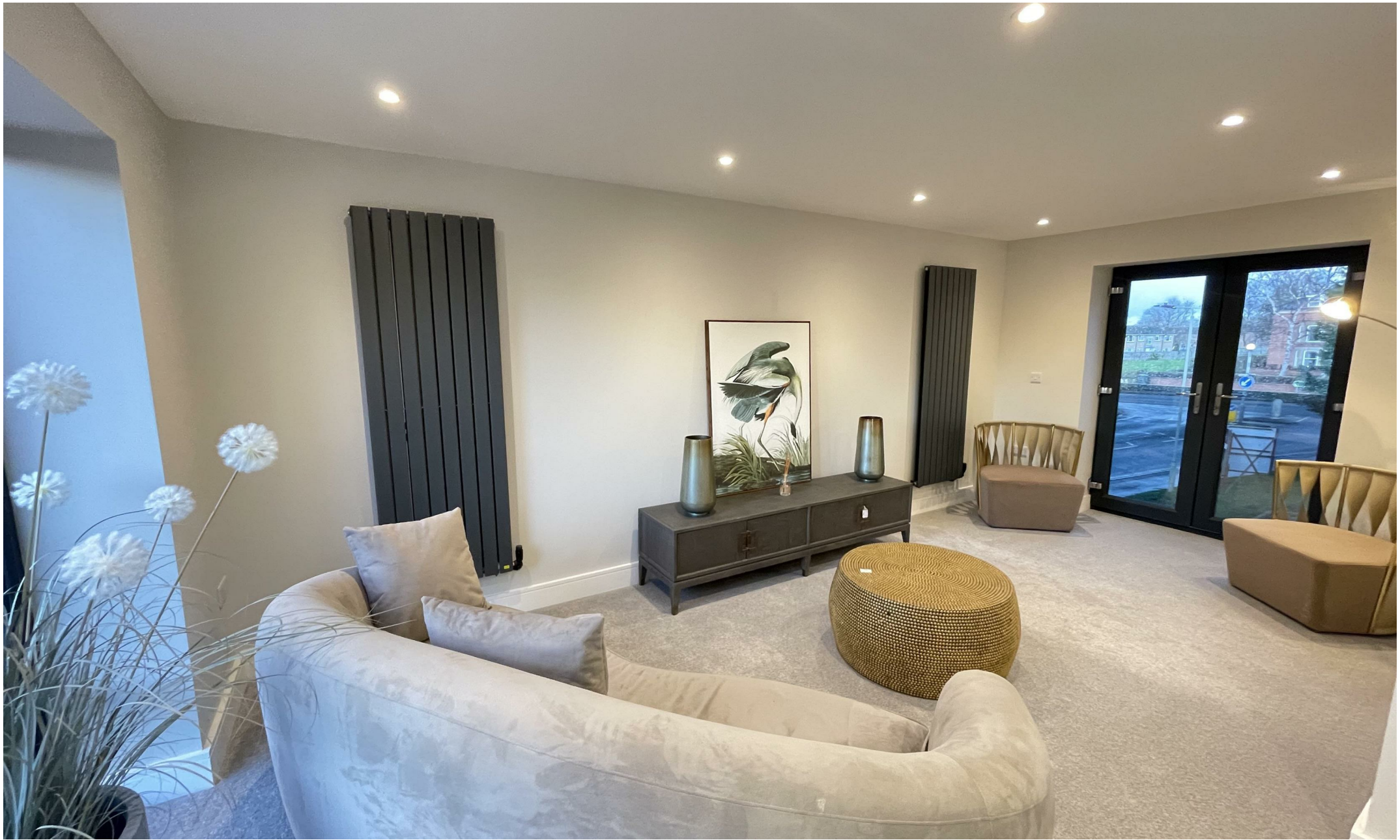
Apartment 4, Scalby View Apartments, 17 Hackness Road, Scarborough, YO12 5SD Price Guide £200,000