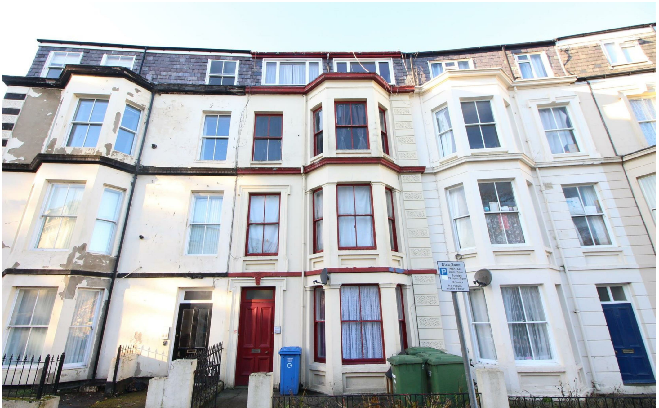
6 Crown Crescent, Scarborough, YO11 2BJ Offers Over £320,000