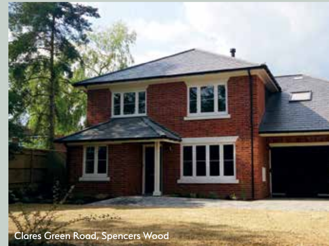
Clares Green Road, Spencers Wood