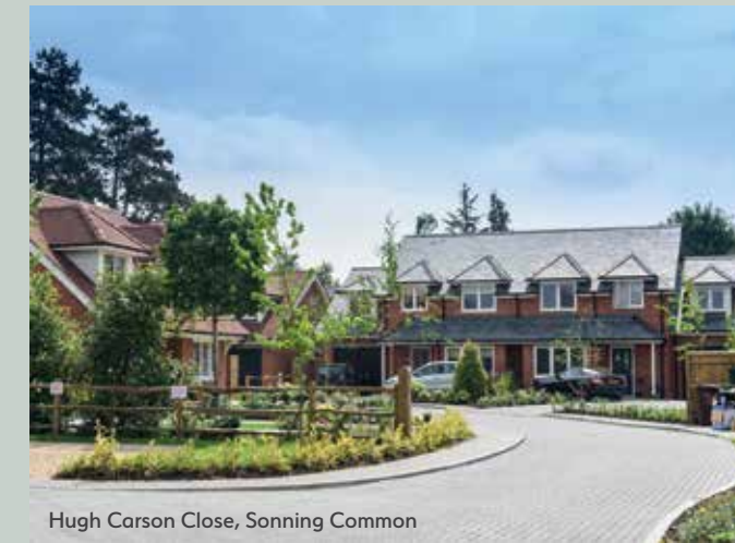
Hugh Carson Close, Sonning Common