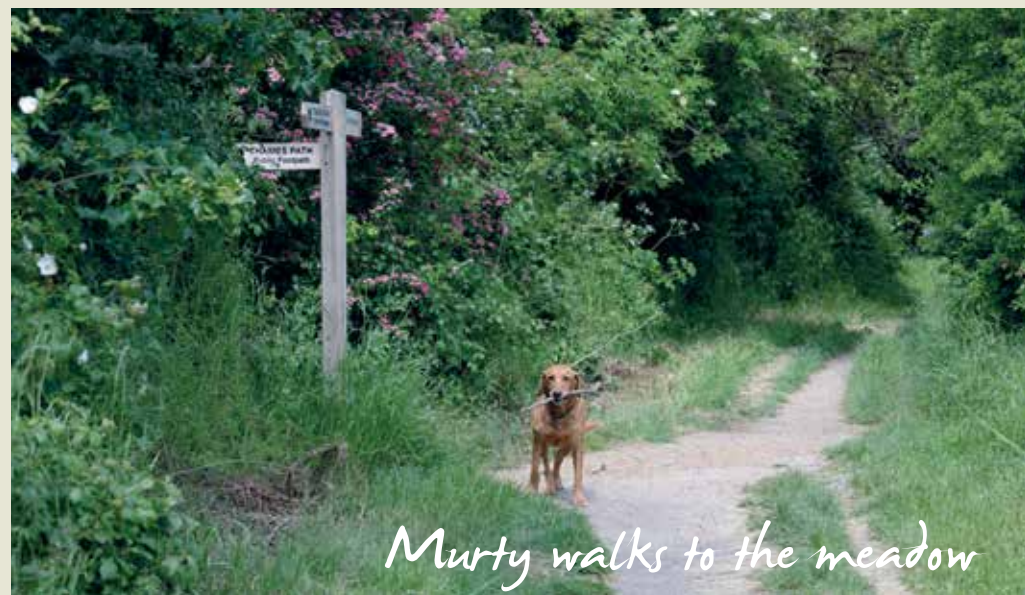
Murty walks to the meadow