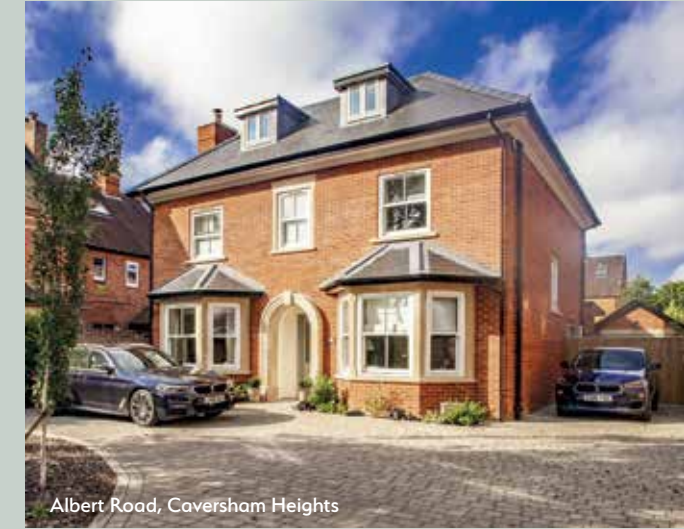
Albert Road, Caversham Heights