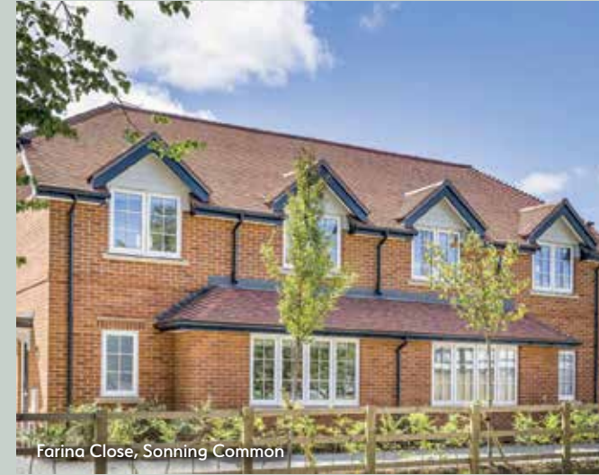
Farina Close, Sonning Common