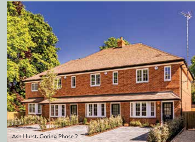
Ash Hurst, Goring Phase 2

“ At Elegant Homes, we believe that good design improves people's lives and all of our houses are designed and built for better living. ”