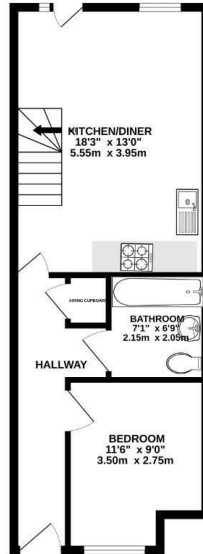
GROUND FLOOR 468 sq ft. (43.5 sq m.) approx.