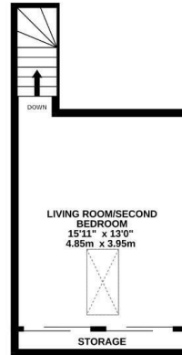
1ST FLOOR 254 sq ft. (23.6 sq m.) approx.