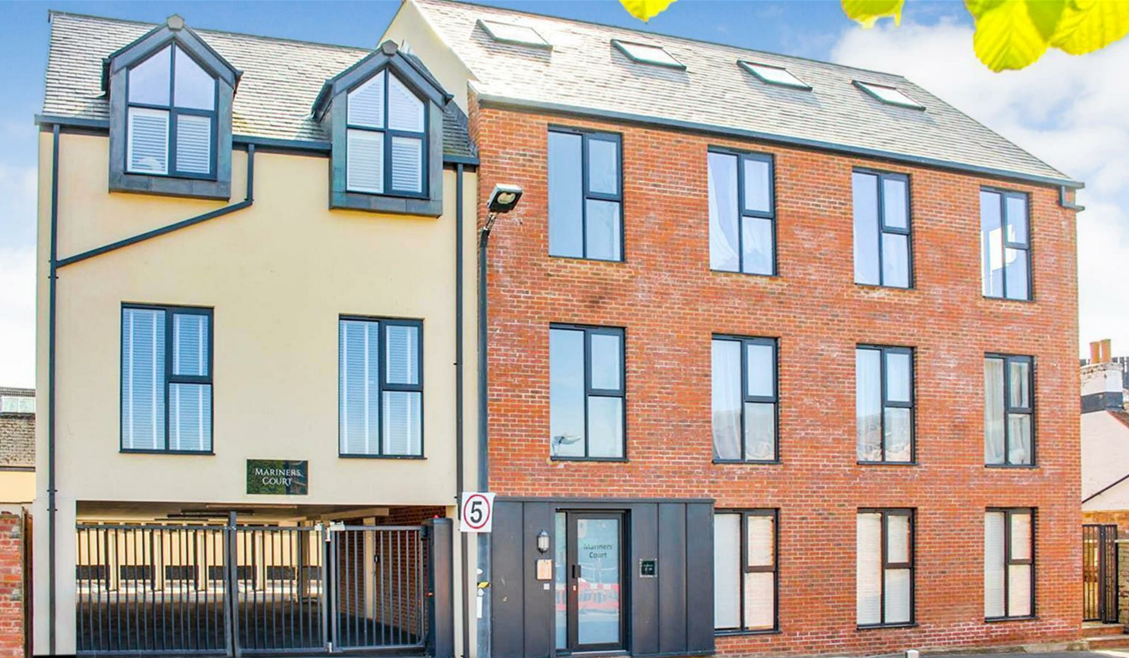
Mariners Court, Gloucester Docks GL1 2EH £190,000