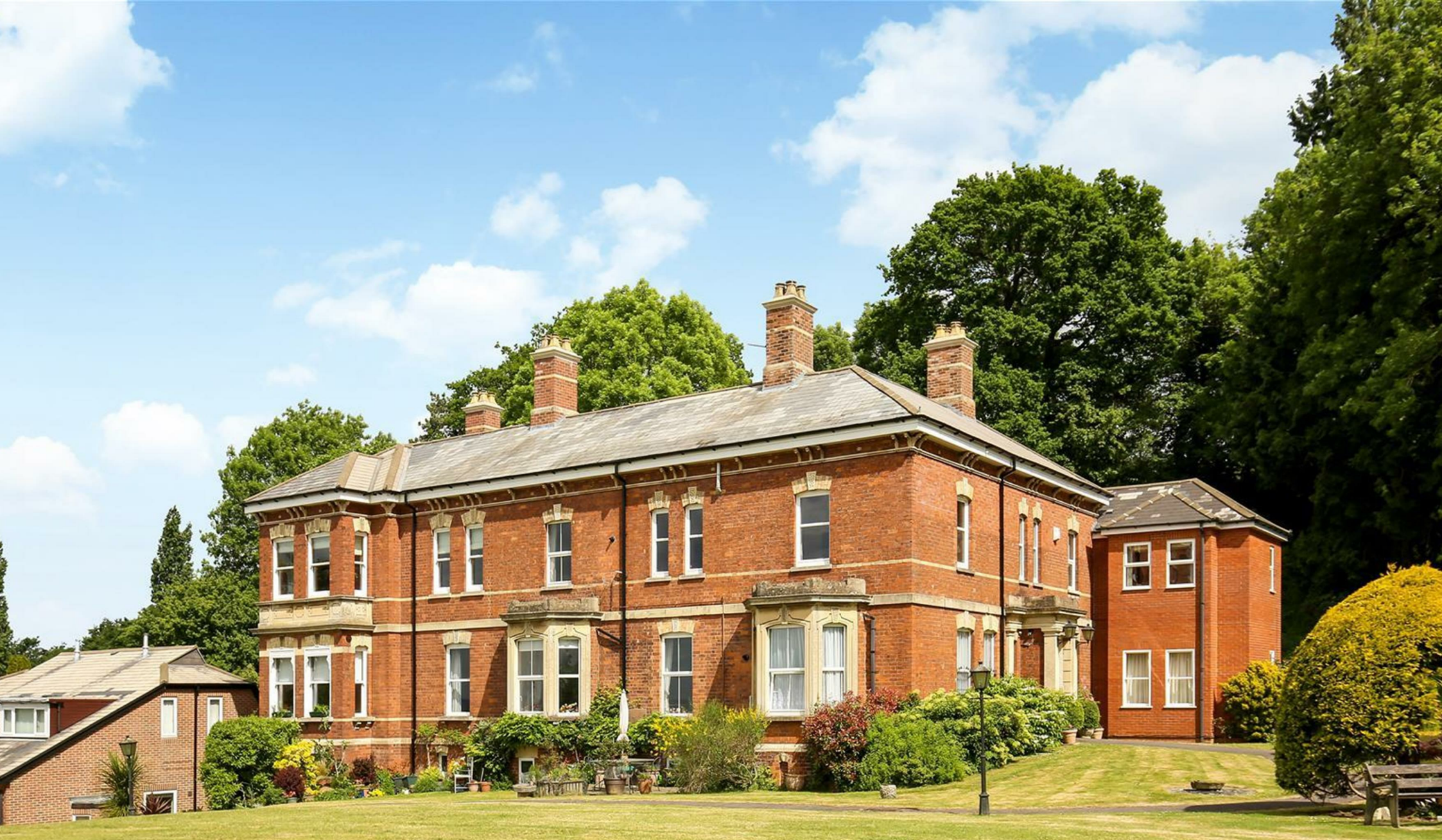
Oakbank House, Tuffley GL4 0AZ £270,000