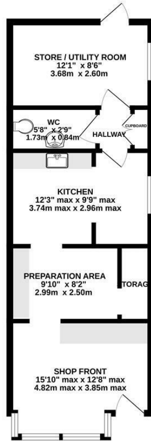
GROUND FLOOR 443 sq.ft. (41.1 sq.m.) approx.