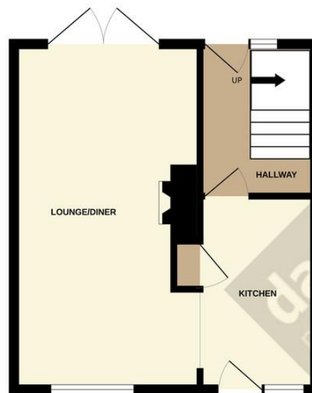
GROUND FLOOR 31.1 sq.m. (335 sq.ft.) approx.